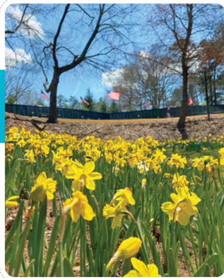
The Wall That Heals at Newtown Park